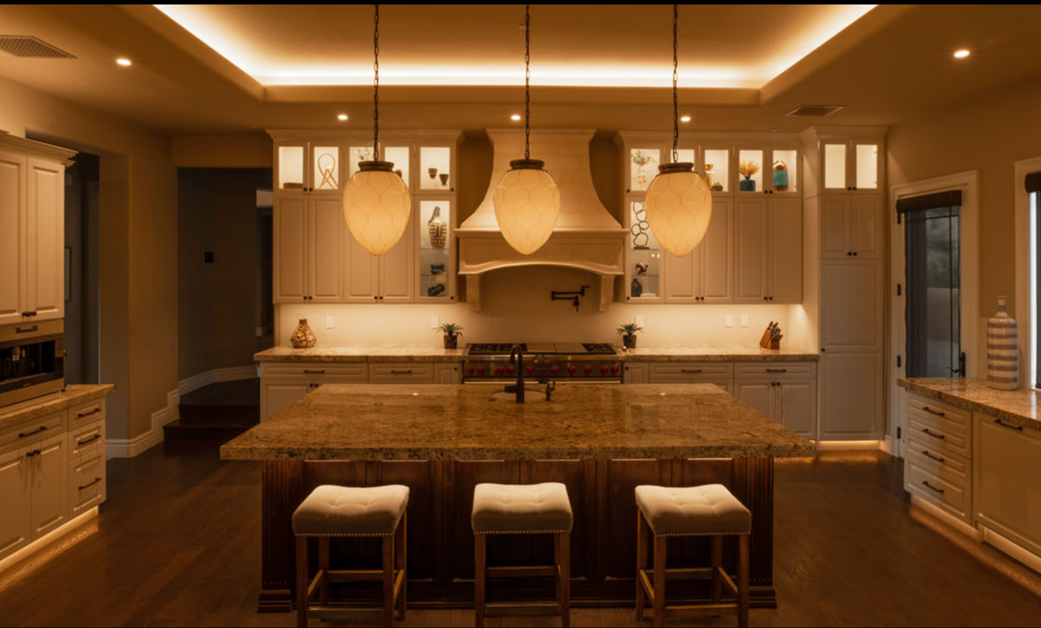
With layers of light.