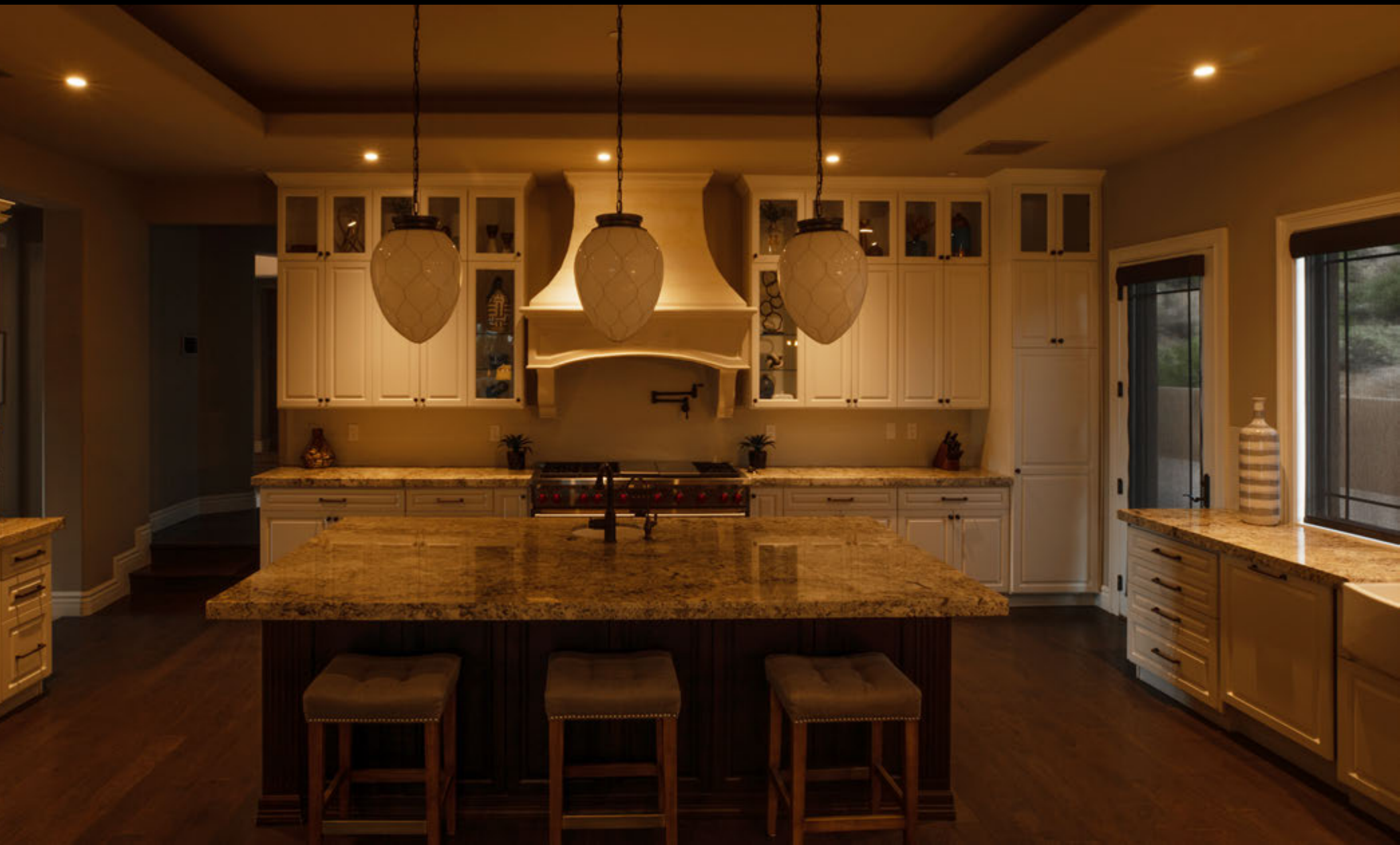
Standard lighting without layers of light.